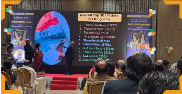
Thane Premium recognised with position no. 2 for overall TRF giving in RID 3142 during Amrit Mahotsav Awards.